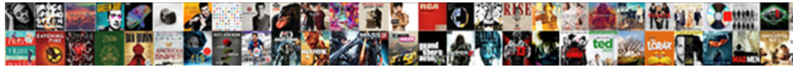
Table Loom Vs Floor Loom